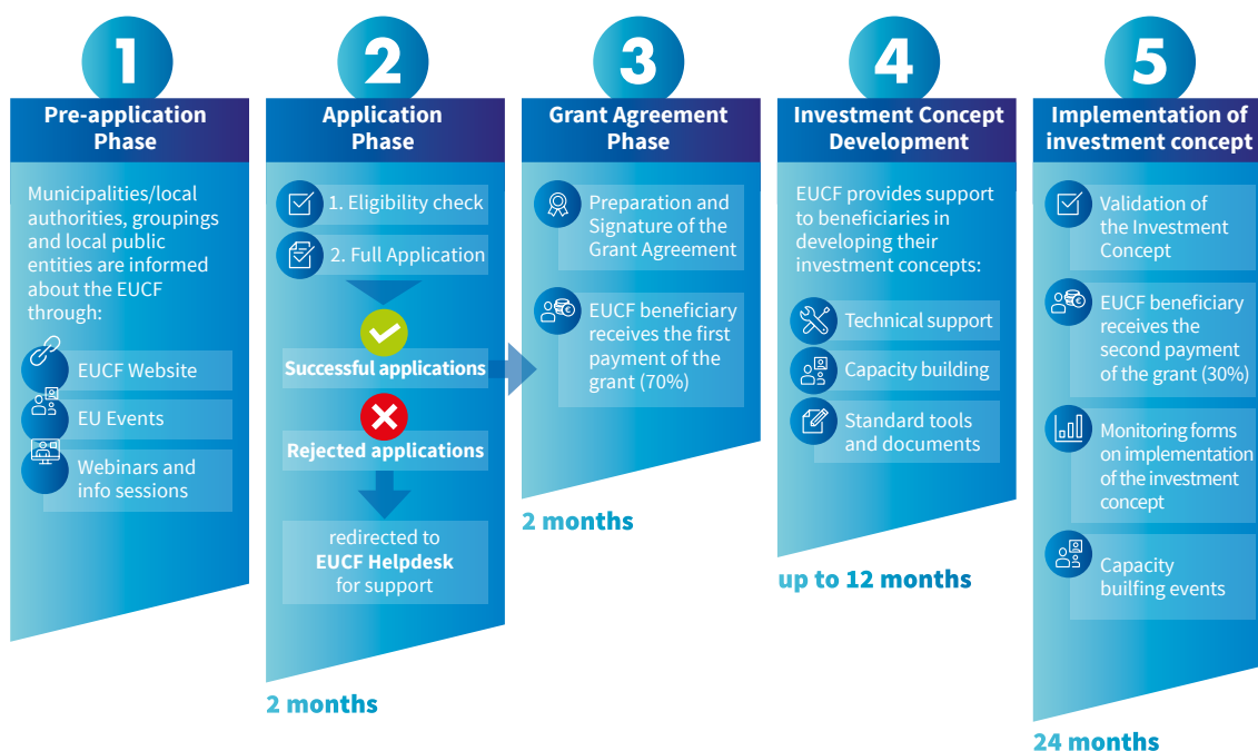
Example of the EUCF Roadmap for a call

It is really important that at the end of the process, each participant is informed of the final result and receives a feedback report , which will help applicants that were not selected to improve for the next call.